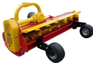
Option of wheels instead of rear roller.