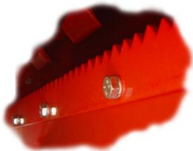
Easy replaceable counter blade