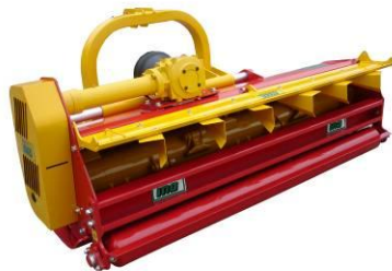
Deflectors for wider spreading of mulch.